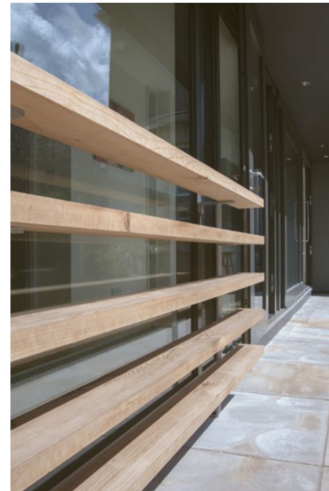
Glazed screen with lift and slide, swing door and iroko bris soleil