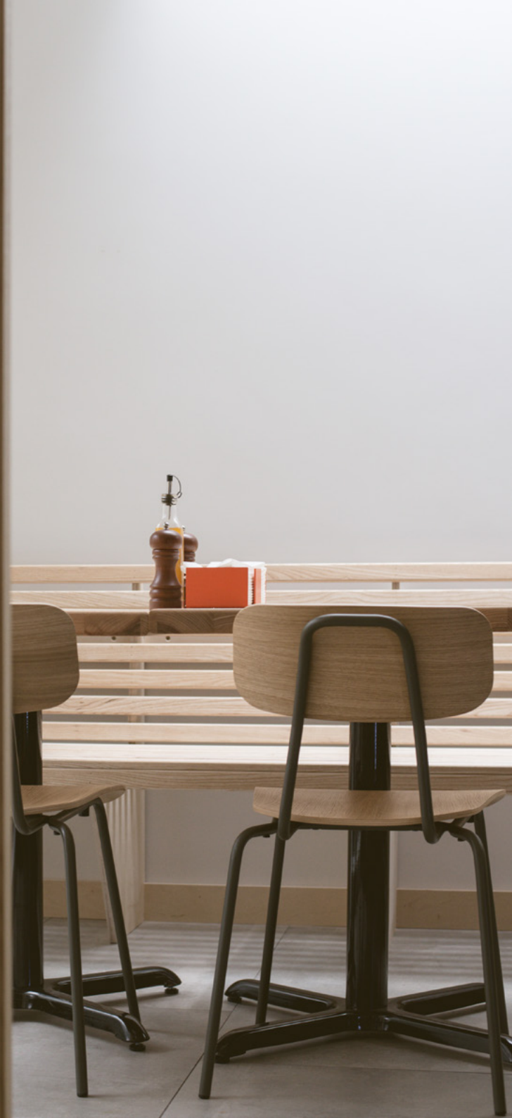
Right page: Ash bench seating in Clifton restaurant