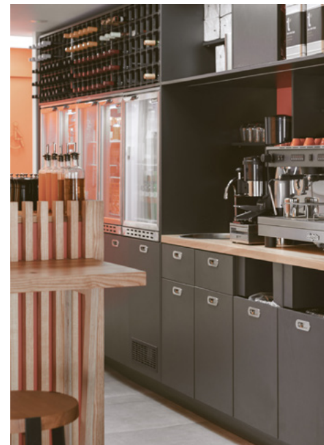
Bespoke waiters' station in grey formica