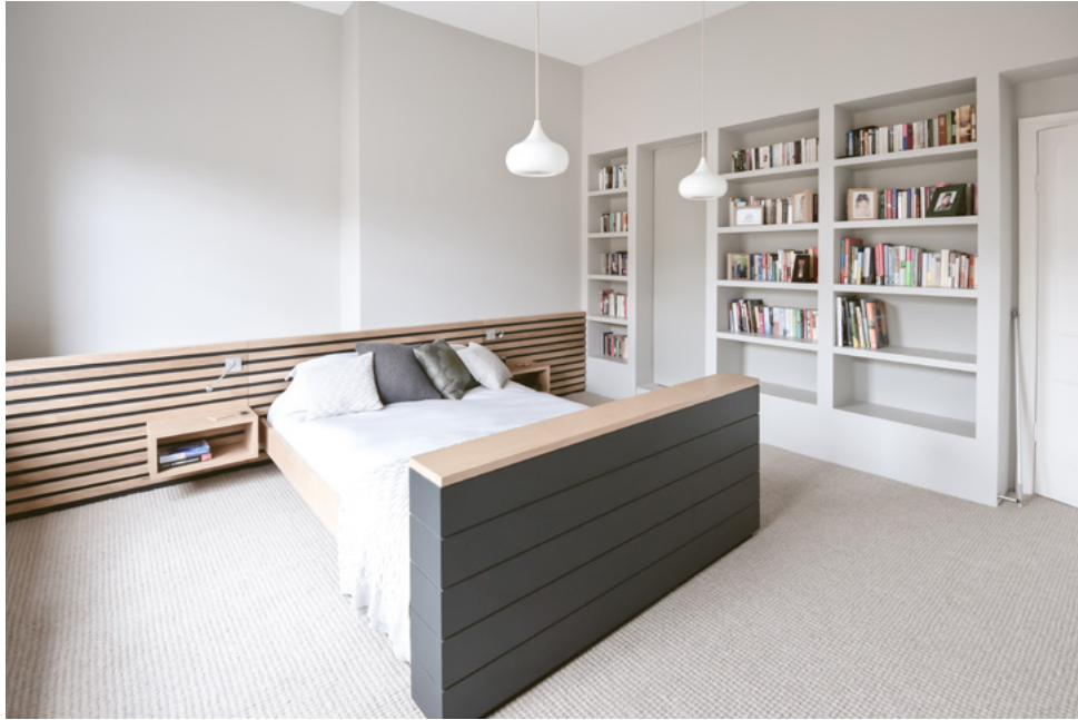
Fitted bedroom space with bespoke headboard, shelving and concealed TV lift