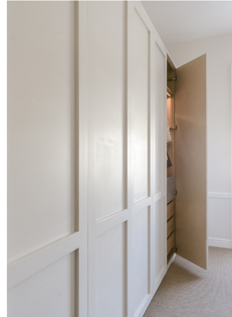
Hidden cupboards in panelled wall