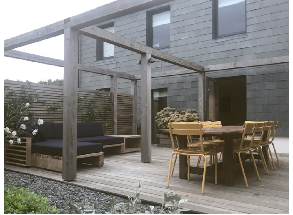
Green oak garden frame and outdoor sofa