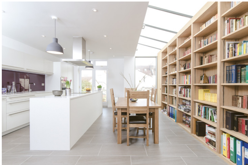
Floor to ceiling oak shelving