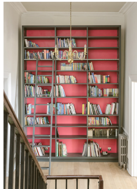
Tall landing shelves with library ladder