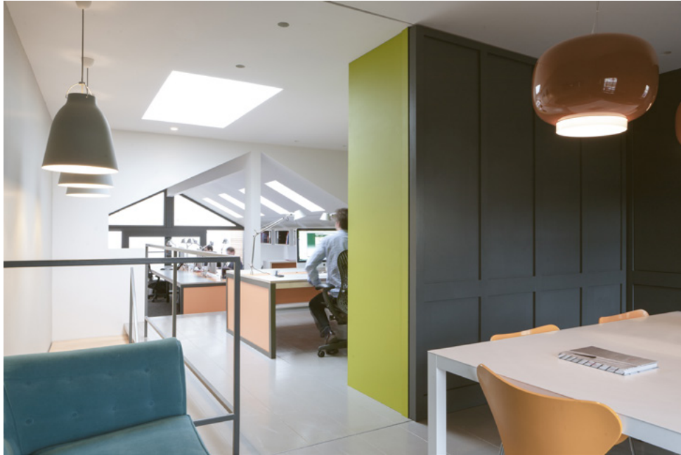
Office fit-out in Clifton, Bristol including large sliding doors