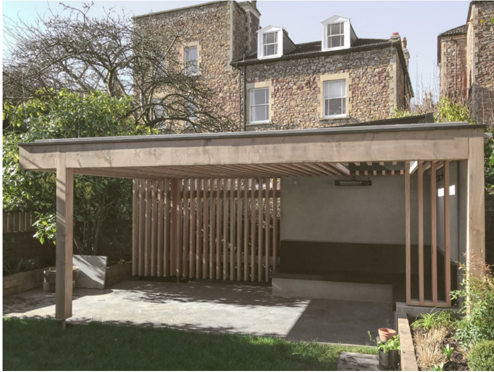
Douglas fir contemporary garden structure, fabricated off-site at our workshops in panel form and erected in two days