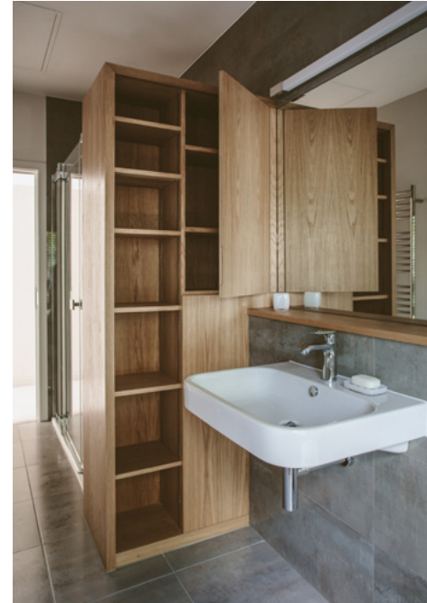
Bookend bathroom storage