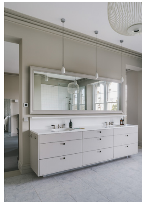
Free-standing sink unit with and matching mirror