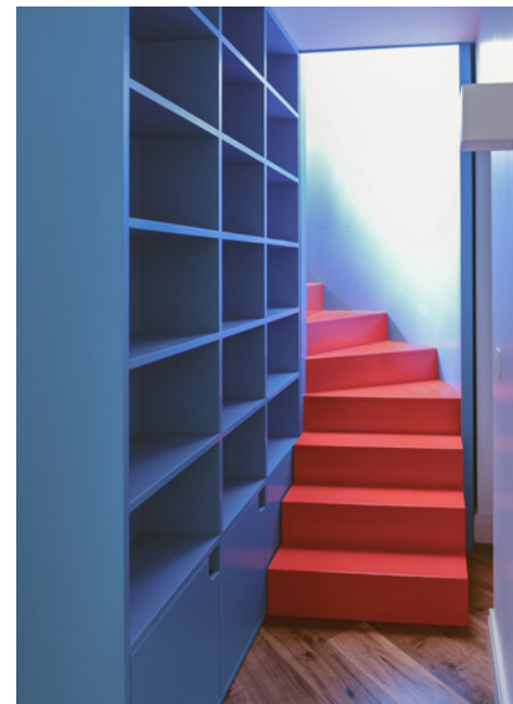
Painted fitted furniture and staircase