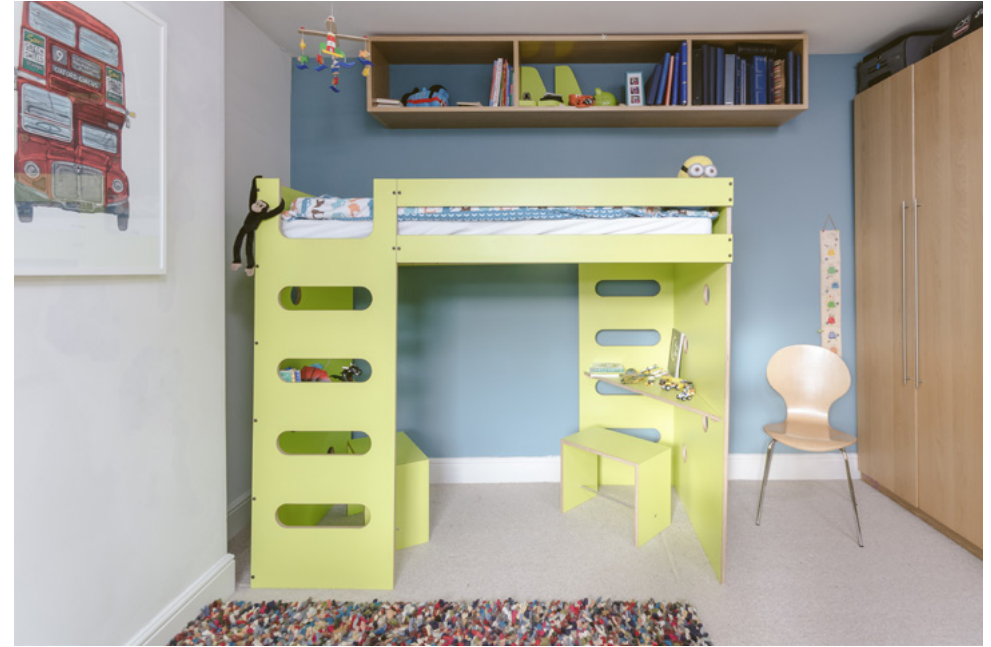
Bespoke kids raised bed in green formica faced birch ply