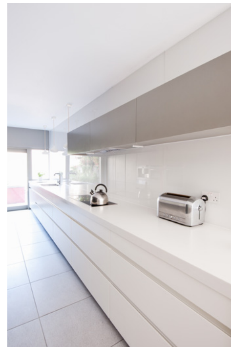
Modern liner kitchen in white lacquer

Left page: Modern handleless oak kitchen with corian worktops