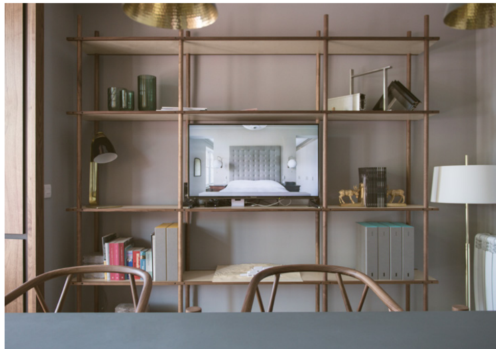
Walnut dowel display shelving with brass fittings