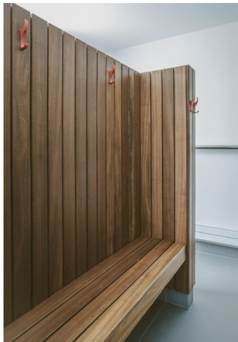
Changing space bench with hook storage as part of base- ment swimming pool project