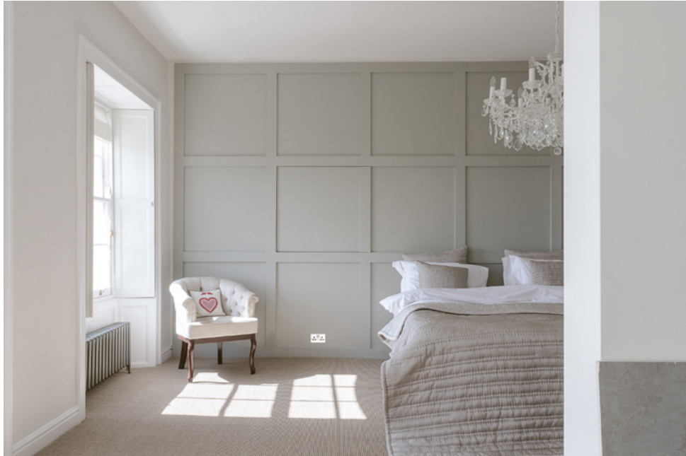
Painted panelled walls