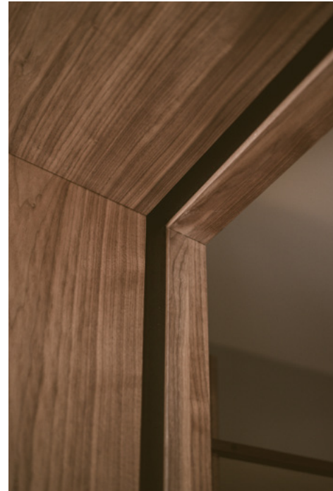
Walnut panelling detail