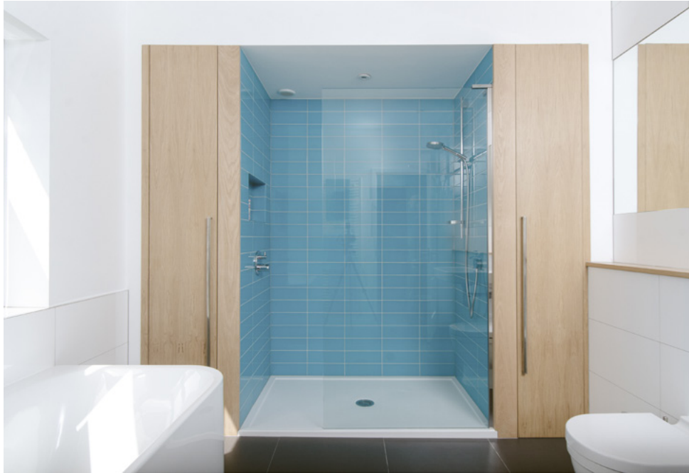
Shower enclosure storage