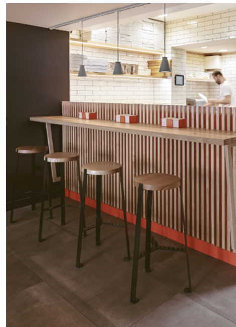
Ash-slatted panelling with bar seating