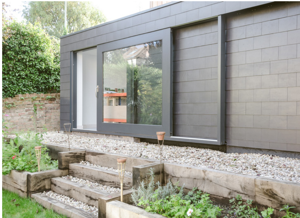
Lift and slide doors