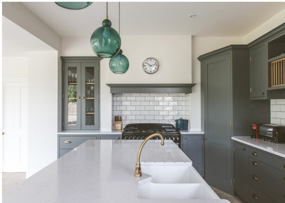
In-frame shaker kitchen