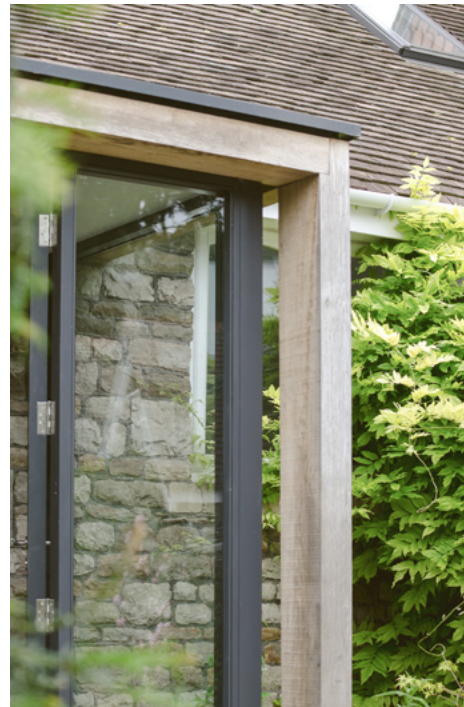
Oak framing to porch in conjunction with aluminium doors