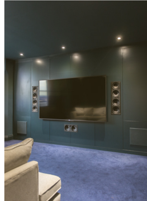
Built-in home cinema system