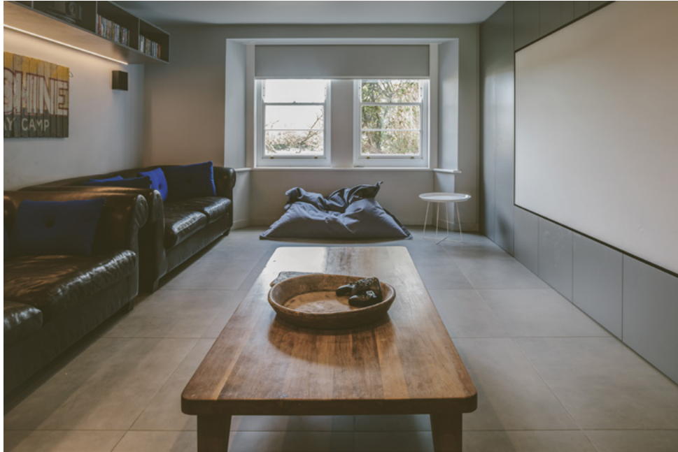
Home cinema with flush projection screen