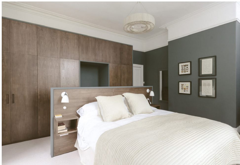
Walnut bed and matching fitted cupboards