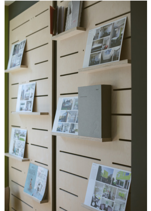
CNC'd retail display panels

Left page: Walnut panelling in high-end retail space