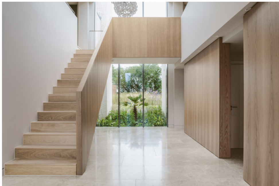
Architectural oak staircase and wall panelling

Previous page: Contemporary cherry, steel and glass staircase in grade II Listed house