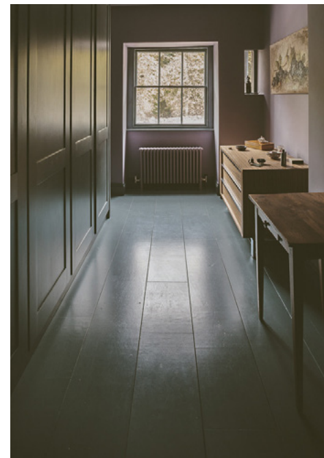
Panelled dressing room