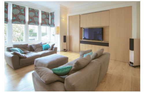
Room divide with sliding doors to reveal TV and AV system