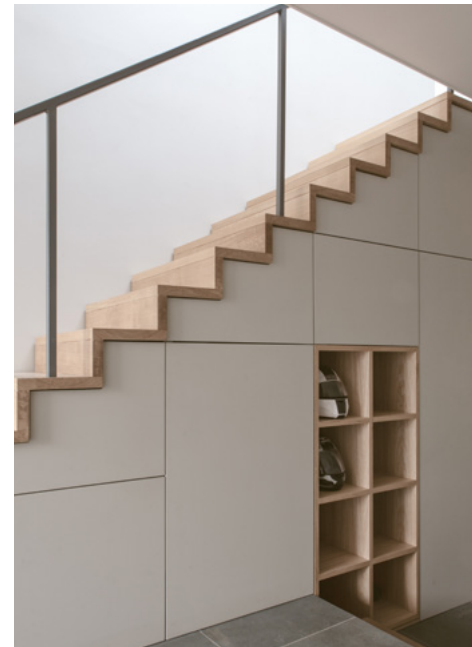
Architectural stairs with flush handleless storage