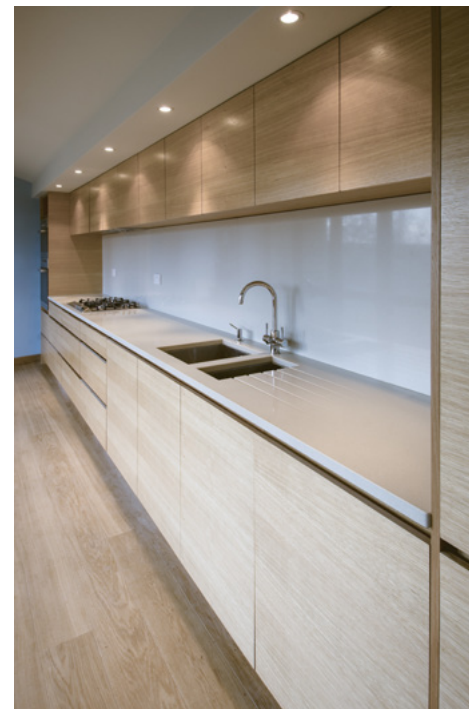
Grain-matched oak kitchen