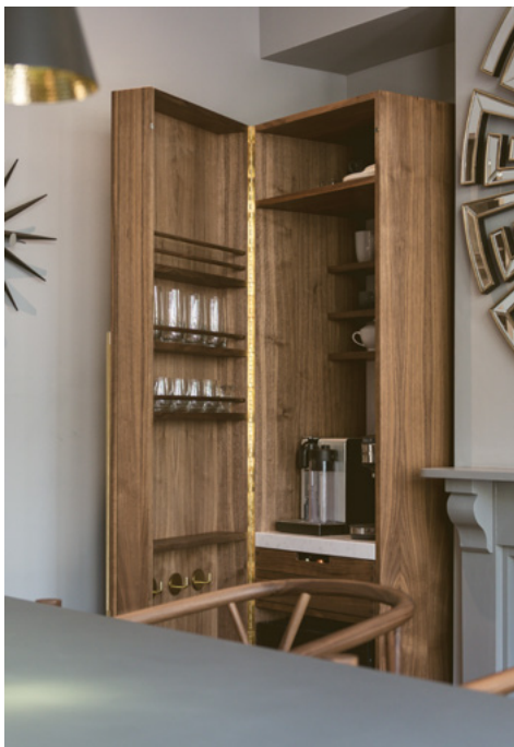
Coffee machine cupboard