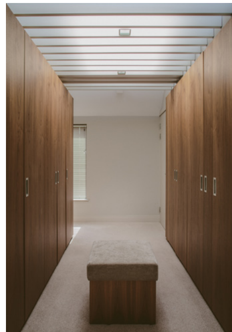
Double-sided dressing room in walnut