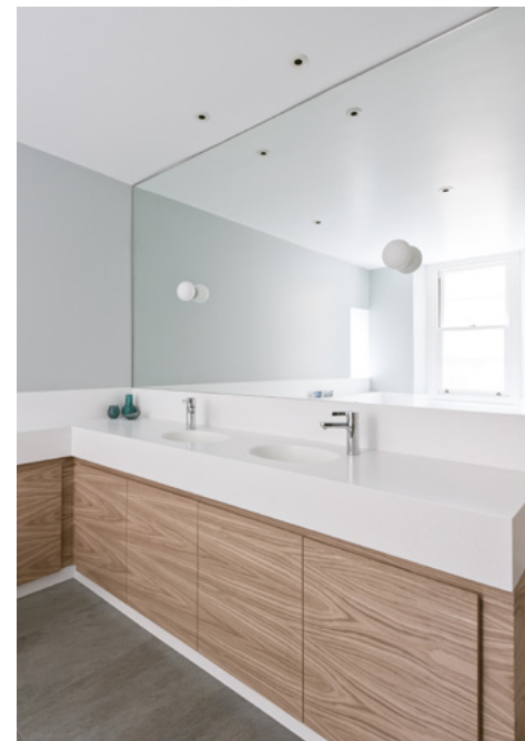
Fitted grain matched oak and corian bathroom units

Left page: Oak and corian bathroom cabinet and mirrored dividing wall