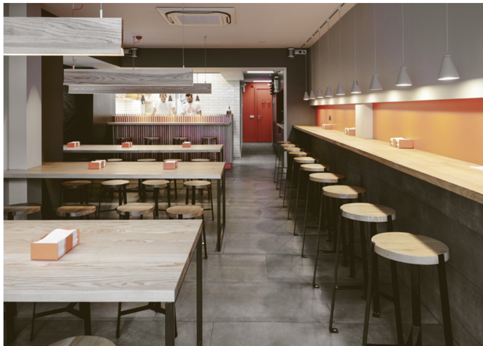
Restaurant furniture and fit-out using ash in Bristol