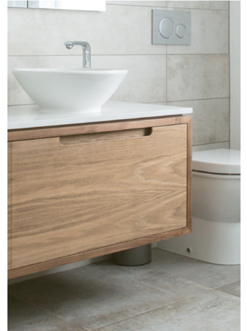
Vanity unit with handleless drawer